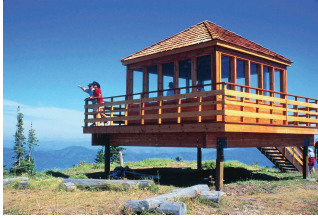
Kellogg Peak Fire Lookout